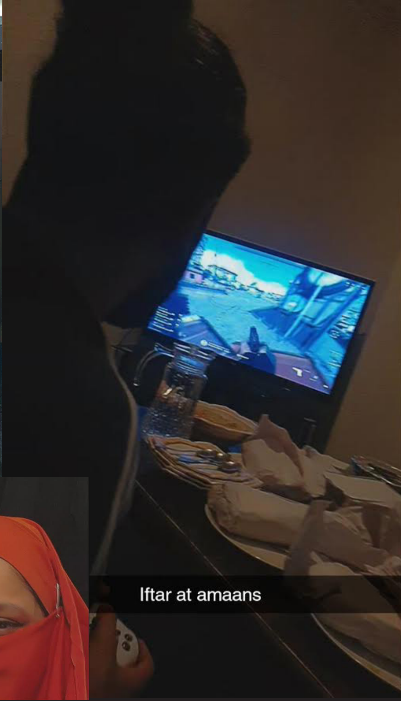
Iftar at amaans